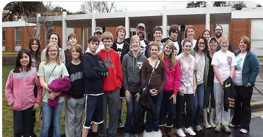
The Factory (VUMC's Youth) pose outside the Wooddale Retirement Home after leading worship and visiting with the residents during the "Outsiders" Lock-In January 20 -21, 2012.