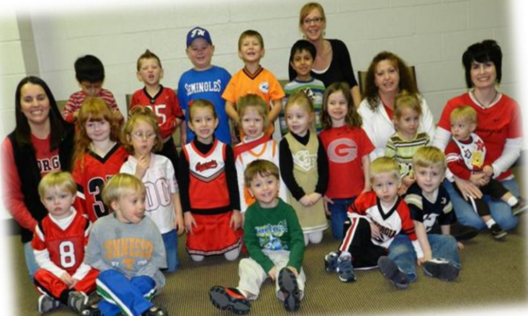
Varnell UMC's Praise & Play Preschool kids celebrate favorite Sport Team Shirt Day!